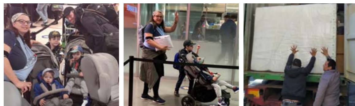
Left: Family at the airport; Loading lorry.

The second request came from a musical couple whose only possession to take to Israel was a precious family heirloom: a piano! We found a professional transporter who took care of its delivery to their new flat in Haifa.