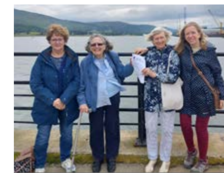
Some of the teams involved in Shavuot Aliyah Outreach 2022