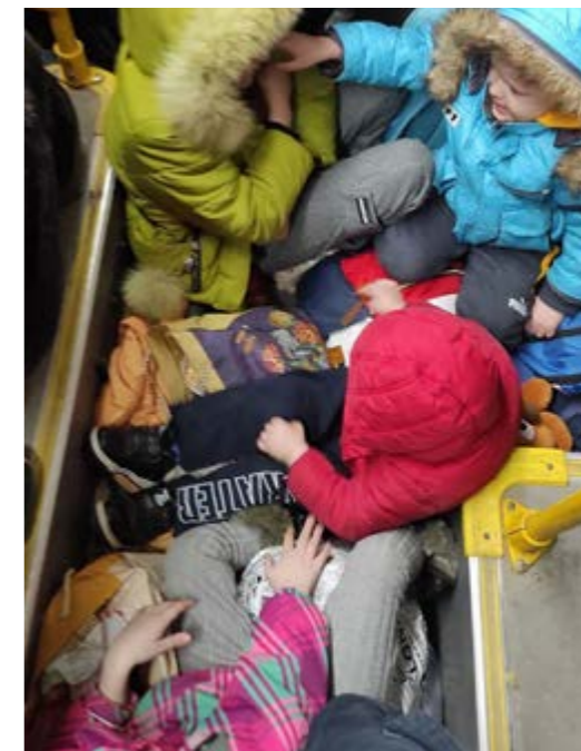
Left: Passengers had to sit on the bus floor.